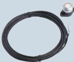
RLN4856 Foot switch with Remote PTT