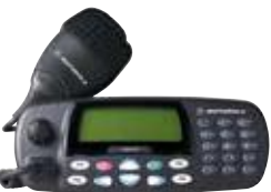
GM339 Select V

Easy to use, users have the flexibility to dedicate the most useful operations to these specific buttons for instant one-touch access.