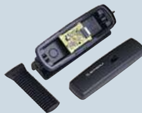
Remote Mount Kit