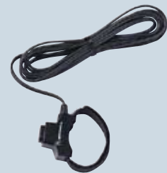
RLN4857 Push Button with Remote PTT