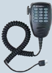
AARMN4026 Keypad Microphone

A comprehensive range of accessories is also available so that the radios can be customised to suit your needs. Adding the proper handset, speakers, microphones & mounting accessories can enhance your productivity. Motorola accessories are built with the highest quality standards and are specially engineered to assure maximum performance of your radio.