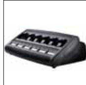
Multi-Unit Charger WPLN4187 (US Cord) WPLN4188 (UK Cord) WPLN4189 (Euro Cord)