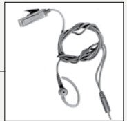
2-wire surveillance BDN6667 (Biege) BDN6729 (Black)