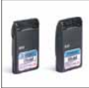
Slim & Hicap Lilon Batteries JMNN4023/JMNN4024