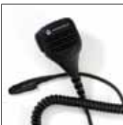
Remote Speaker Microphone IP57-Rated (Mic Head Only) PMMN4023