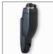
Accessory Adapter PMLN4455