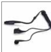
Earbud with Microphone/PTT PMLN4519