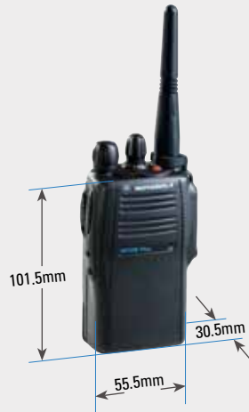
GP328 Plus with slim battery