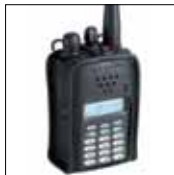
Soft Leather Case with Swivel Clip PMLN4521