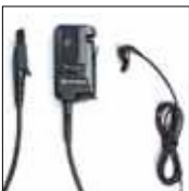
VOX/PTT Interface Module shown with JMMN4064 Ear Microphone BDN6768