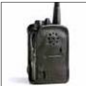
Soft Leather Case with Swivel Clip PMLN4421**