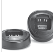
Single Unit Charger PMTN4024 (US Plug) PMTN4025 (Euro Plug) PMTN4026 (UK Plug)