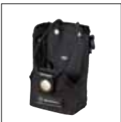
Nylon Case with Swivel Clip PMLN4470**