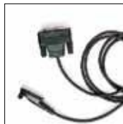
Programming Cable JMKN4123