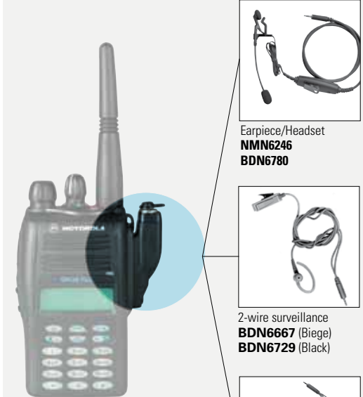
PMLN 4455 to be used with 3.5mm threaded range of Audio Accessories