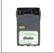
1350mAh FM Lilon Battery PMMN4073