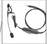
Earpiece/Headset NMN6246 BDN6780